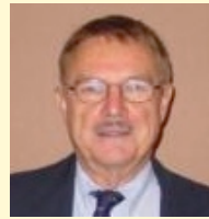
HISTORICAL PERSPECTIVE By Owen Clary